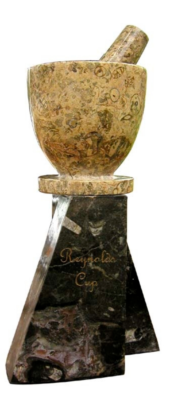
Figure 2 . The Reynolds Cup trophy, awarded once every two years to the winner of an international quantitative mineral analysis competition (see http://www.dttg.ethz.ch/reynoldscup2004.html).